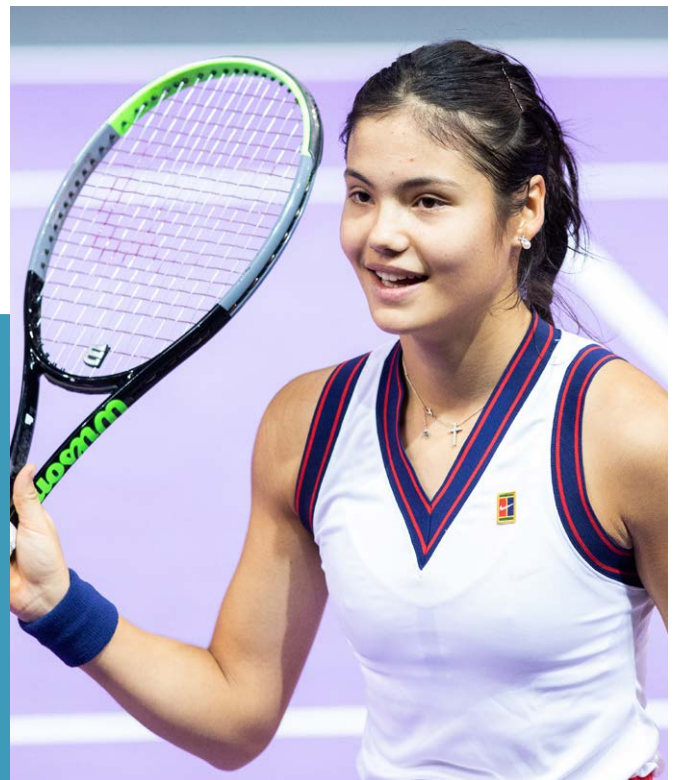
Emma Raducanu in action during a match at WTA Transylvania Open International Tennis Tournament. Cluj-Napoca, Romania. 25 October 2021

The Wimbledon website is a good source of ticket and event information.