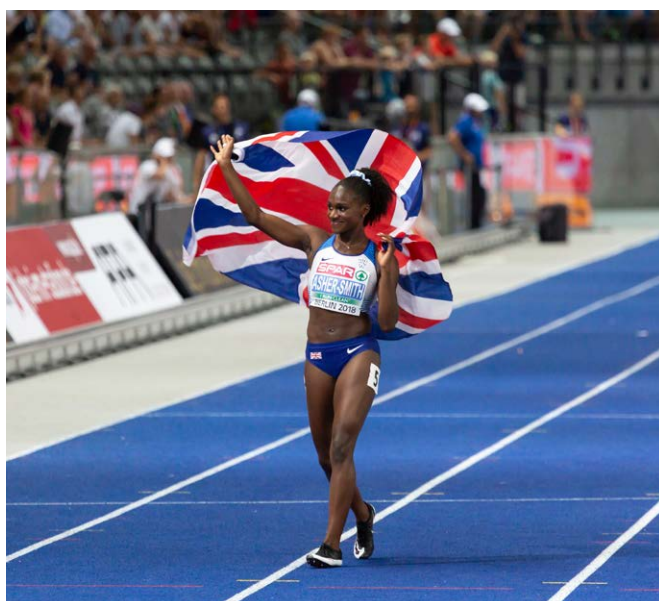
Dina Asher-Smith at the 2018 European Athletics Championships. Berlin, Germany. 7th August 2018

There will be 19 different sports, attracting world-class competitors from 72 different nations.