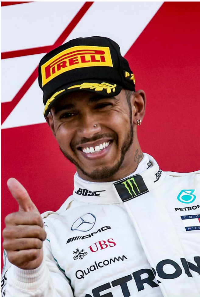
Lewis Hamilton, Mercedes, celebrating his victory on the podium. F1 World Championship 2018. Barcelona, Spain. 13th May 2018

Lewis Hamilton clearly likes it, having won a record eight Grand Prix held there.