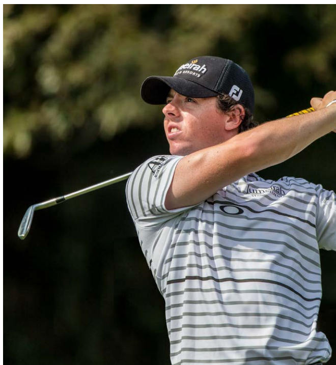
Rory McIlroy hits a shot on Bethpage Black at the Barclays. Farmingdale, NY. August 21, 2012

To add more history to the occasion, this year's event will be held at St Andrews in Scotland, long thought of as golf's spiritual home.