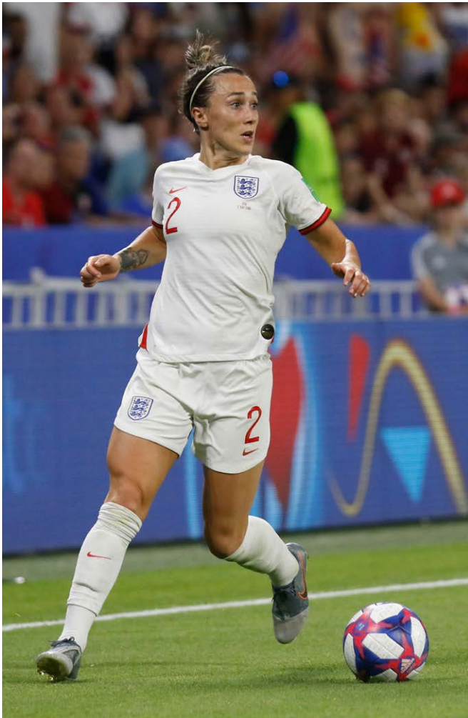
Lucy Bronze during the FIFA Women's World Cup France 2019 semi-final football match England vs USA. Groupama Stadium, Lyon, France. 2nd July 2019

16 teams will compete over a 25-day period, with the final at Wembley on the last day of July.