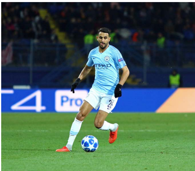
Riyad Mahrez of Manchester City during the UEFA Champions League game against Shakhtar Donetsk. Kharkiv, Ukraine. 23rd October 2018

There's also unanimous optimism. Every team – from the Premiership down to non-league level – starts with a clean slate, which all adds to the atmosphere of hope and anticipation.